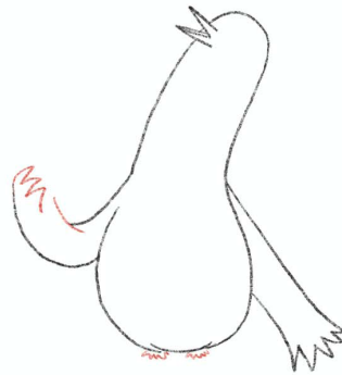
5. Add some squiggly lines at the end of her right wing, and at the bottom of her body