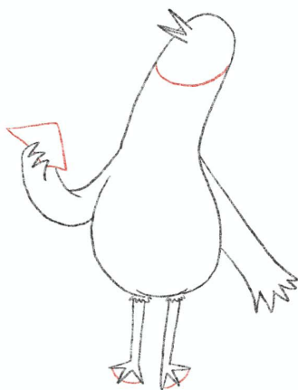
7. Now join up her toes to give Seagull webbed feet. Add her sheet music and her head markings