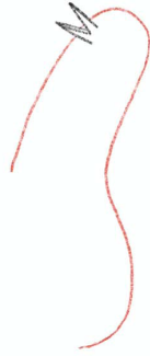
2. Starting from the top of her beak, draw a loose b shape and then a line under the beak