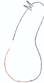
3. At the bottom draw a small line and then curve a line up on the left, but leave a small gap