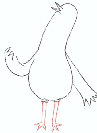
6. Draw her legs